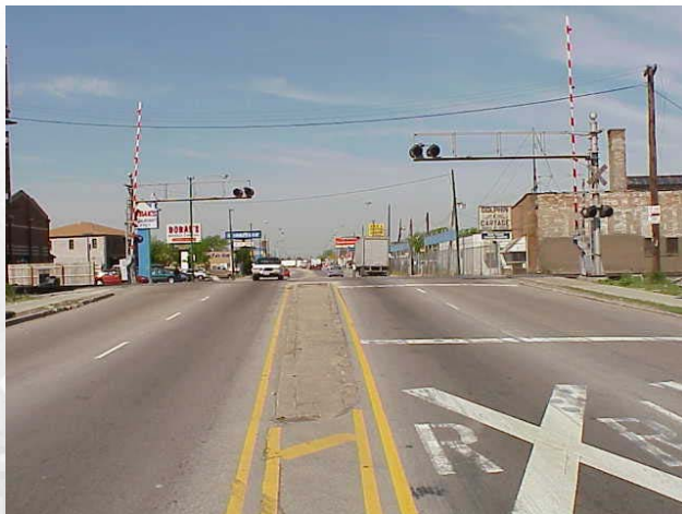
View facing Southwest on Archer Avenue