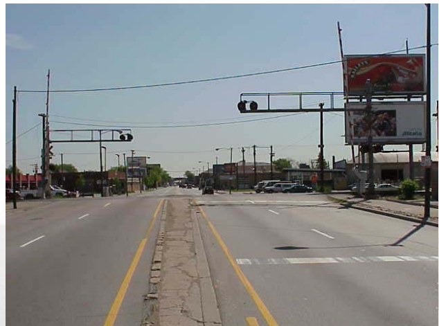
View facing Northeast on Archer Avenue